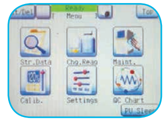
QC data is available on board with comprehensive reports and also available through Insight™ quality control program.